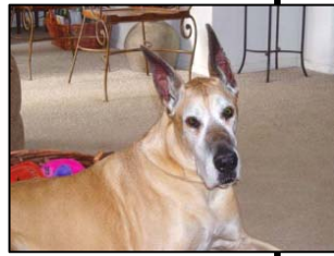
Daisy at 9 Years Old