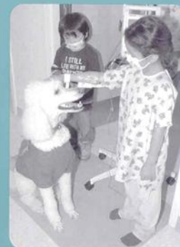
Pediatric inpatients enjoyed a recent visit from "Nick" the poodle.

For a complete Animal Assisted Therapy schedule, please visit the Voices website at http://voices-pc .