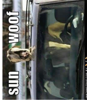
—Submitted By Susie Powell