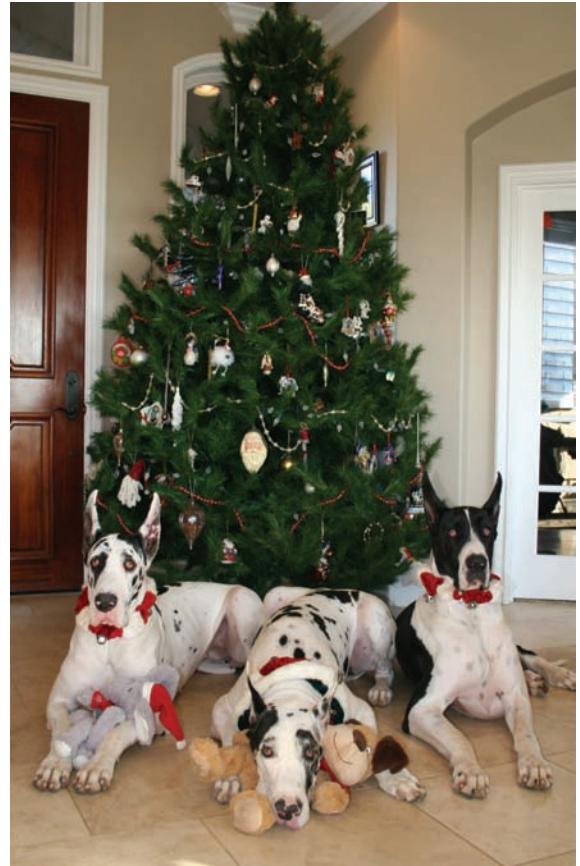
The Lampe Family Lampe Danes