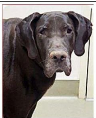
Wildomar Shelter Bessie was dumped in the shelters night drop box. Rescued by Big Bones Canine Rescue