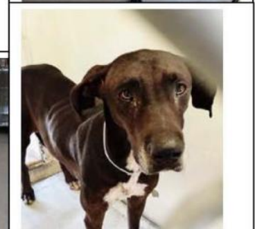
Carson Shelter: Mother w/ 6 pups Rescued by Big Bones Canine Rescue

Find out how you can help, contact Susie Powell 661-373-1894