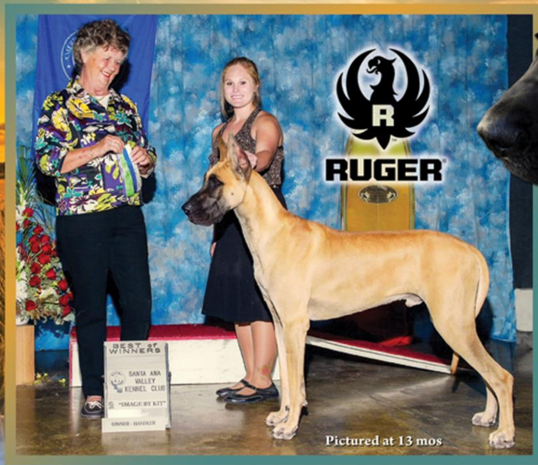
Pictured at 13 mos

BISS Int'l CH Lampe's Sweet Pickles Don't Ya Love Her Madly CGC NAP NJP ND