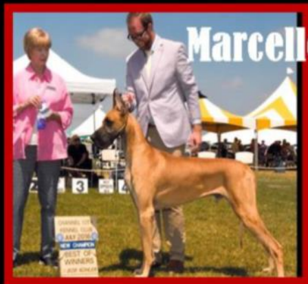
CH Red Sky Dundane W Dun Roman Under the Tuscan Sun DVD