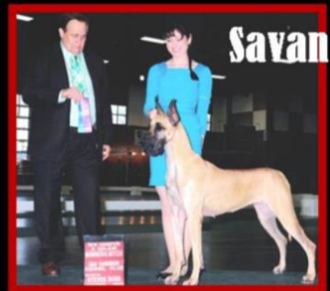
CH Red Sky Dundane W Dun Roman Song of the South