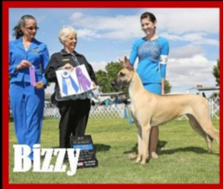
CH Red Sky Dundane W Dun Roman Winter's Song