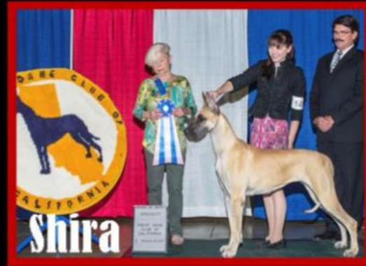
GCH Red Sky Dundane W Dun Roman Old Song, New Melody, AOM