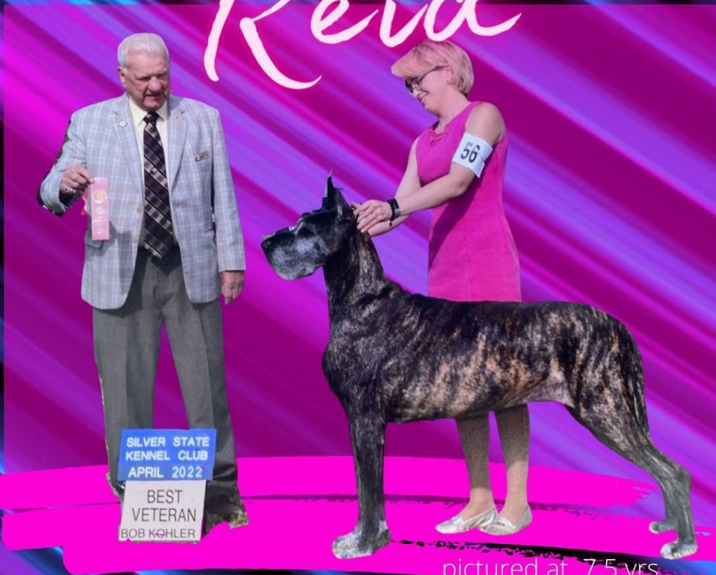
pictured at 7.5 yrs